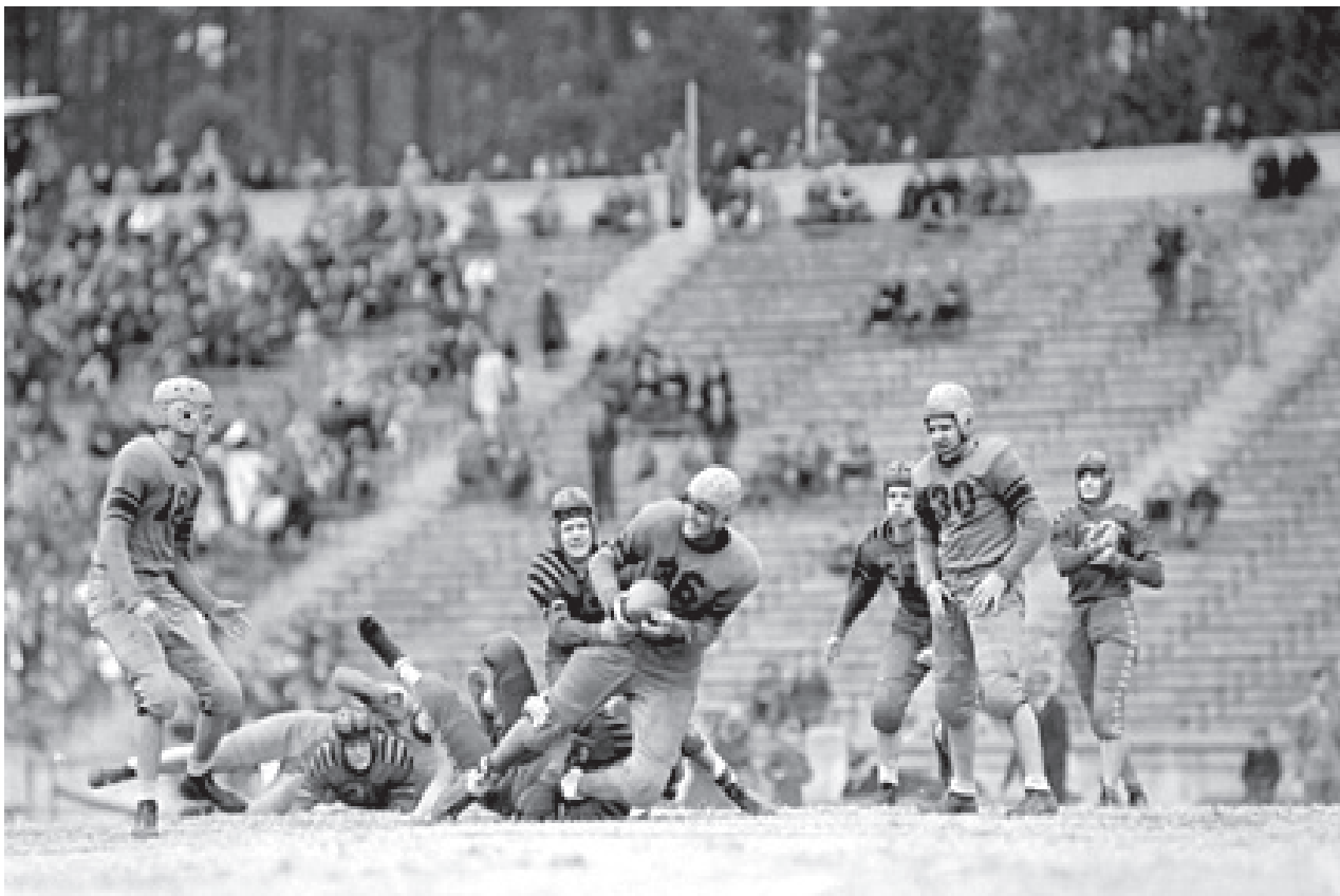
1938 State Championship Football Game in Chapel Hill

Prsrt Std U.S. POSTAGE PAID Asheboro NC 27205 Permit No. 36