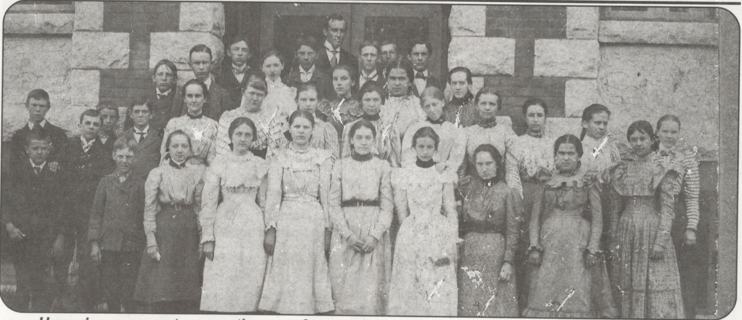
Honoring our past paves the way for our future. This photo remembers Greensboro High School's Juniors & Seniors from the 1899-1900 school year.

Published by the Greensboro Grimsley Senior High School Alumni & Friends Association