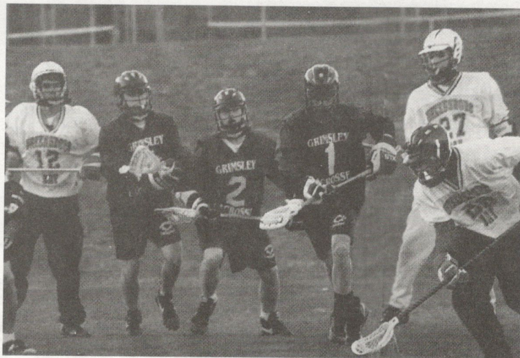
Lacrosse Team shines in '98-'99