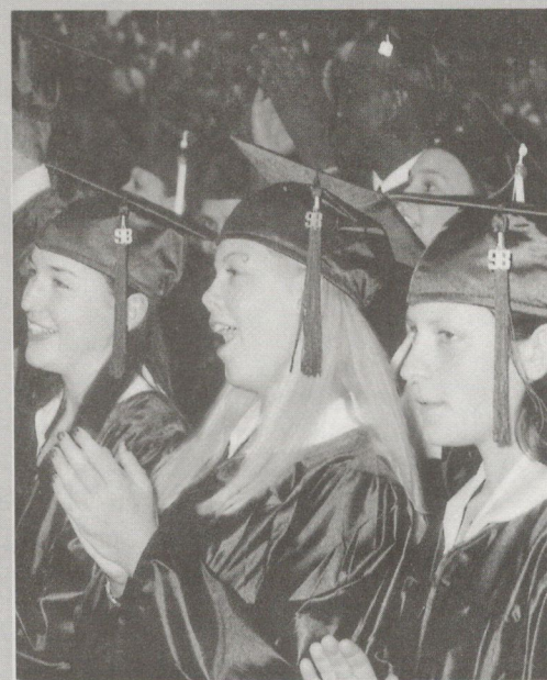
1998 Graduates proud of their accomplishments