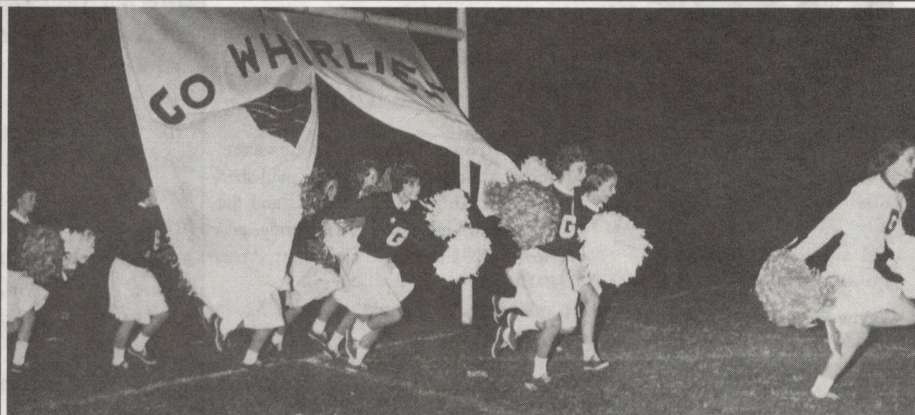
1963 Whirlie Cheerleaders