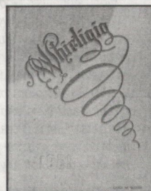
1951 & 1963 Whirligigs