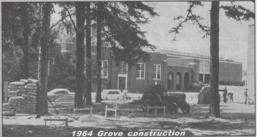
1964 Grove construction