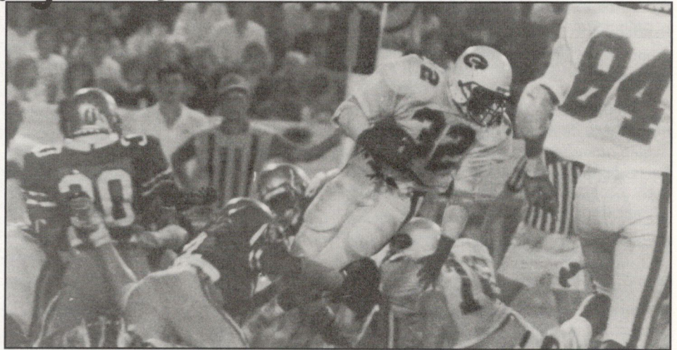
LOOKING BACK . . . AS THE CLASS OF 1988 CELEBRATED THEIR TEN-YEAR REUNION THIS FALL, THEY REMINISCED ABOUT THIS MEMORABLE PLAYOFF GAME WHEN THEY BEAT PAGE 10-7

... The Whirlie Football team got off to a disappointing 1-4 start, but is poised to turn things around after a great win over the #7