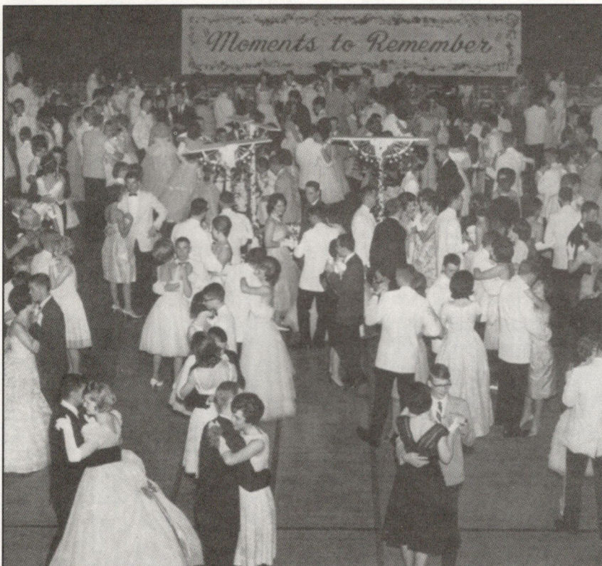
MEMORIES FROM THE CLASS OF 1964. THIRTY-FIVE YEARS IS JUST AROUND THE CORNER.