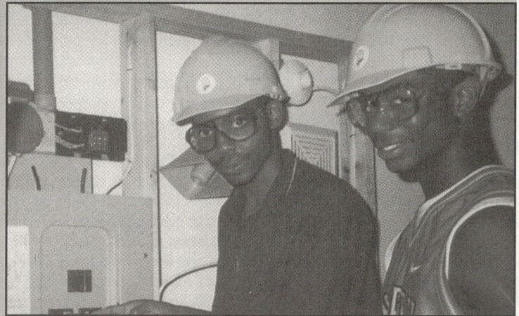
STUDENTS WHO ARE PART OF GHS'S 97-98 APPRENTICESHIP PROGRAM

Our colleges and University Systems continue to receive significant private support and their achievements are well publicized. As our charitable organizations work to meet our many needs, their efforts are praised and the cause is celebrated. Yet we seem to forget the determining role our public schools have played in many of our lives, the far reaching impact they continue to have on the future of all our children. Every community in our country needs to become more aware and involved, to recognize and appreciate the importance of our public system of education, and to understand the costs of neglecting our schools. Every single child whose life is guided in a more productive and healthy direction, is so much more than the dollars saved in health care, unemployment, social services, law enforcement, or charitable resources. These children are the future, the parents of the next generation, our greatest assets, and our most important investment. With our money, our time and our votes, we have the responsibility and the opportunity to help our young people, to provide more solutions for the future instead of more problems. In other words, we can pay now or we can pay later.