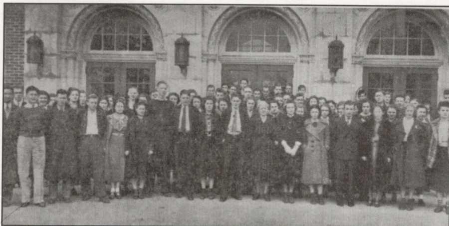
GRADUATING CLASS OF JANUARY 1938, TAKEN FROM THAT YEAR'S ISSUE OF HIGH LIFE

Published by the Greensboro Grimsley Senior High School Alumni & Friends Association