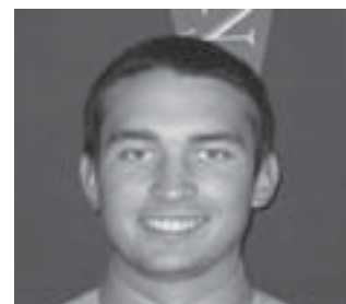
Mitchell Lewis NC State University Class of 1956 Scholarship $1000