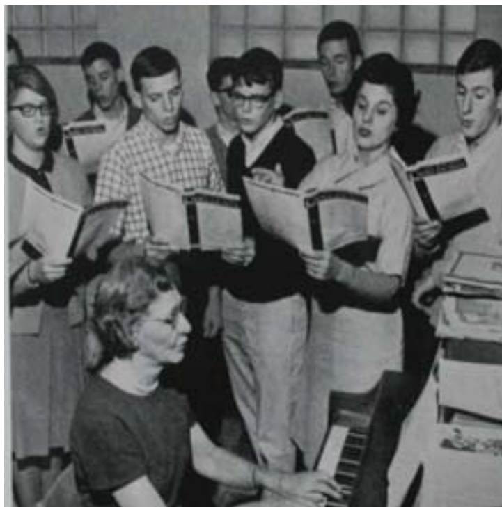
1965 Choir Rehearsal

In instrumental news, the orchestra program at GHS upheld its standard of excellence by once again achieving a superior rating at the NCMEA Festival in Charlotte. Five orchestra students were selected through competitive audition to participate in the North Carolina Honors All State Orchestra in Winston-Salem in November – the highest honor possible for high school string players in North Carolina. Most schools are lucky to have one student selected, let alone five! 13 orchestra students were selected to participate in the NCMEA Western Regional All State Orchestra in Boone. Unfortunately this event was cancelled due to adverse weather conditions in the mountains. Congratulations to Ms. Green Stimpson and her students for these tremendous achievements! The orchestra program also had an excellent student teacher from UNCG this year in Ms. Megan Morris.