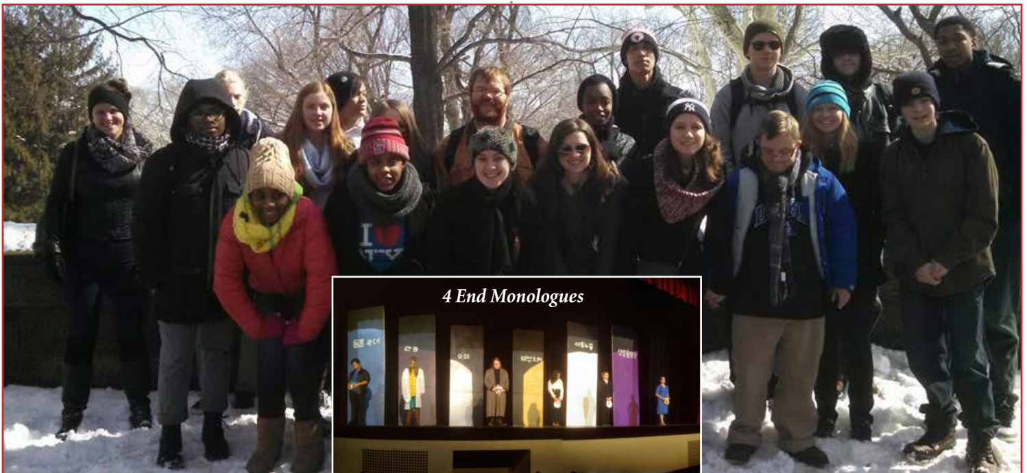
Grimsley Playmasters at Central Park, NYC