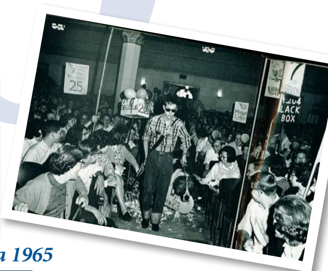
Whirlie Class Elections circa 1965