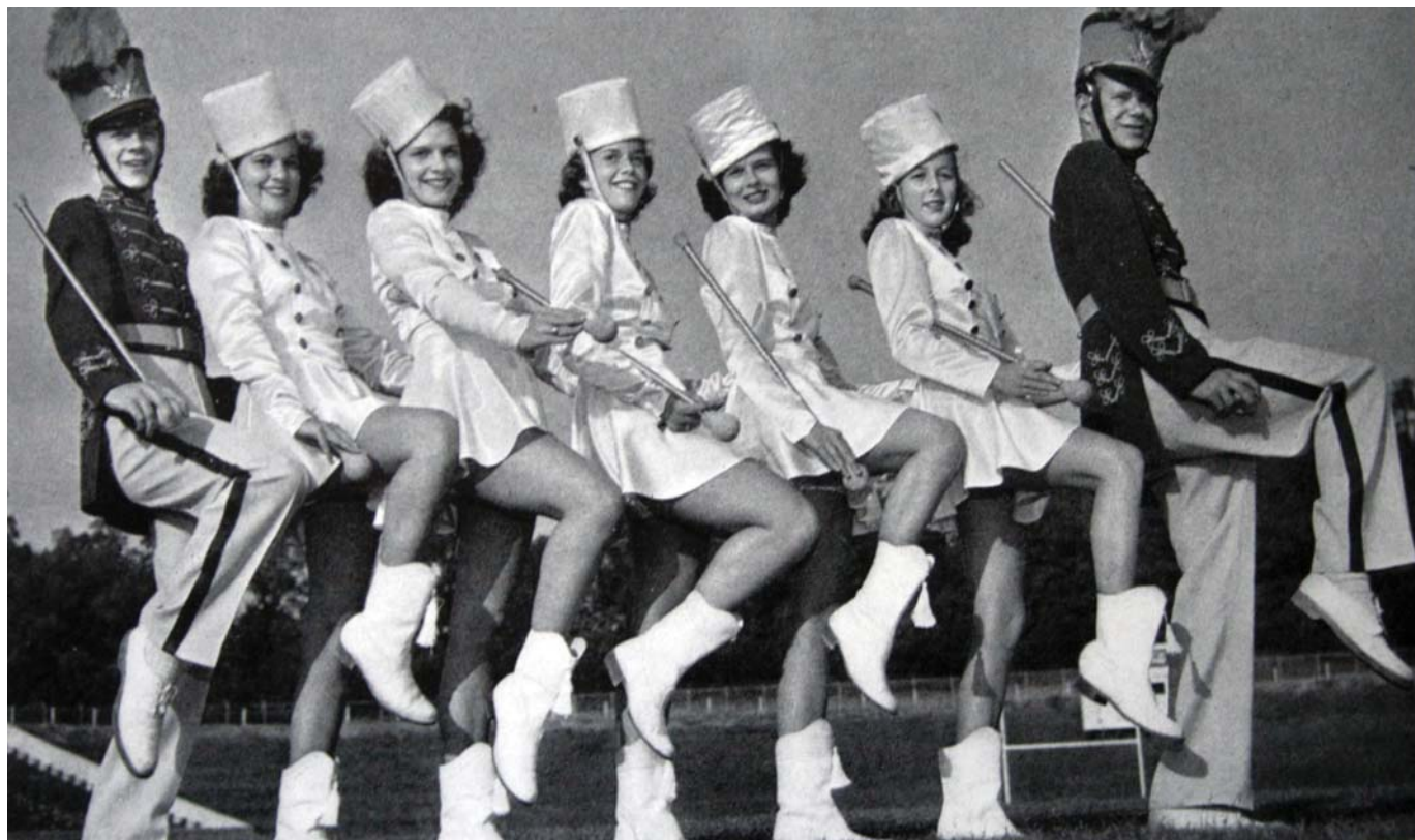
Drum Majors and Drum Majorettes 1949